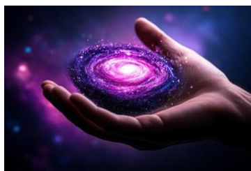
In the Beginning...

As the Spirit broods over the waters of every Baptism, He establishes each baptized person as a new creation—for if anyone is in Christ he is a new creation. In these waters He takes a formless person and gives the form of Christ. He takes a void (empty) person and gives the fullness of Himself—the Spirit of Christ. He takes a person who naturally dwells in the darkness of Satan’s domain and that person hears the Father exclaim, “Let there be light,” and there is light. In short, the Son of God—sent by the Father and conceived by the Holy Spirit in the womb of the Blessed Virgin—has ordained Holy Baptism to bestow the gifts He earned at the cross and the empty tomb, so that spiritually formless, empty and dark people are blessed with a new beginning. And behold it is very good.