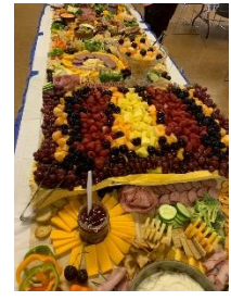
A good time was had by all at Pastor's Meet & Greet. (A lot of food was had by all too!!)